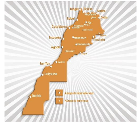
Airports in Morocco